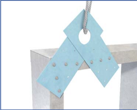
Double Attachment to Wall at End Stud