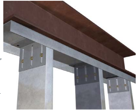
US Patents #5,467,566 & #5,906,080